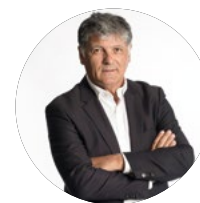
Toni Nadal Homar Rafa Nadal Academy Ambassador

Spanish tennis coach who coached professional tennis player Rafa Nadal for 27 years.